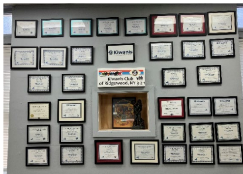
Each year, NY District awards Clubs for outstanding Service. In ONLY 6 Years, the Ridgewood 3-2-1 Club has won lots of awards for their outstanding Service Projects. Kudos to 3-2-1 members.