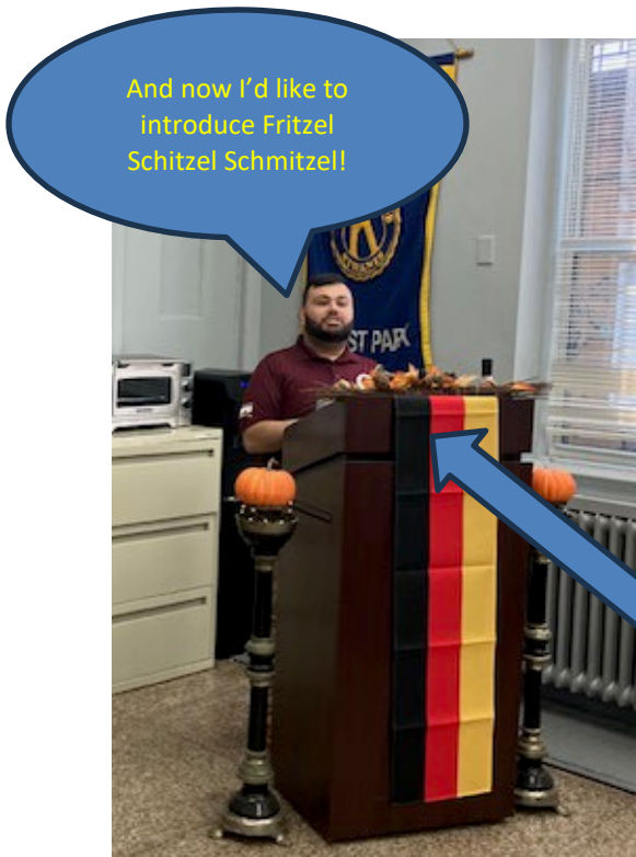
And now I'd like to introduce Fritzel Schitzel Schmitzel!